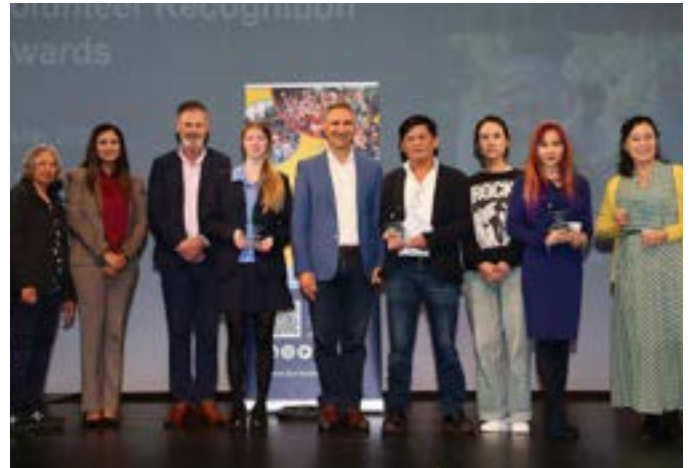
The MC Team on stage during the awards ceremony together with winners from other categories.